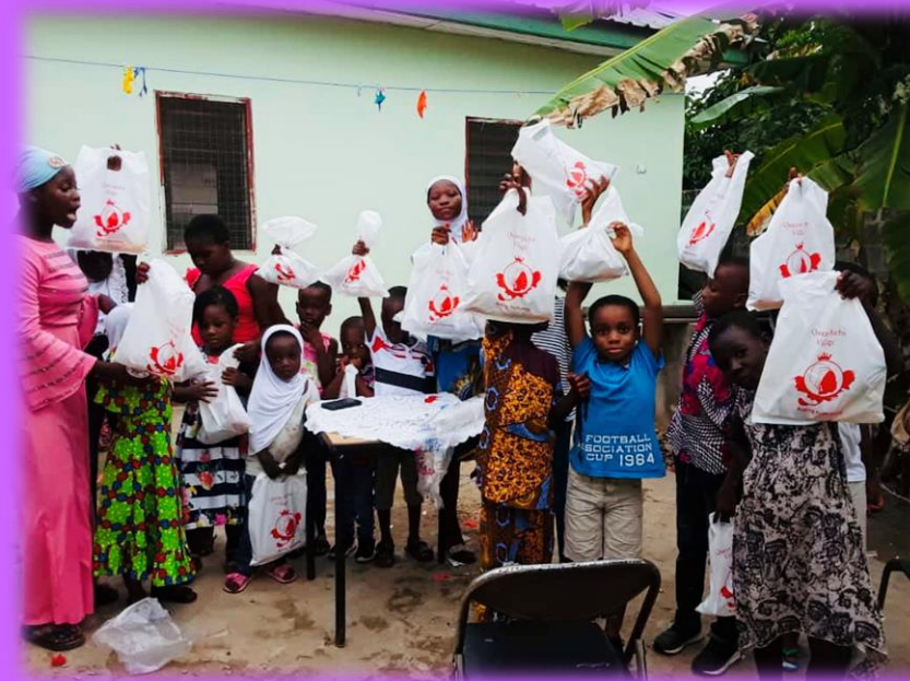
Eid Fitr, Takoradi, Ghana