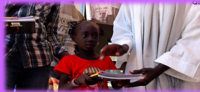
School Supply Distribution