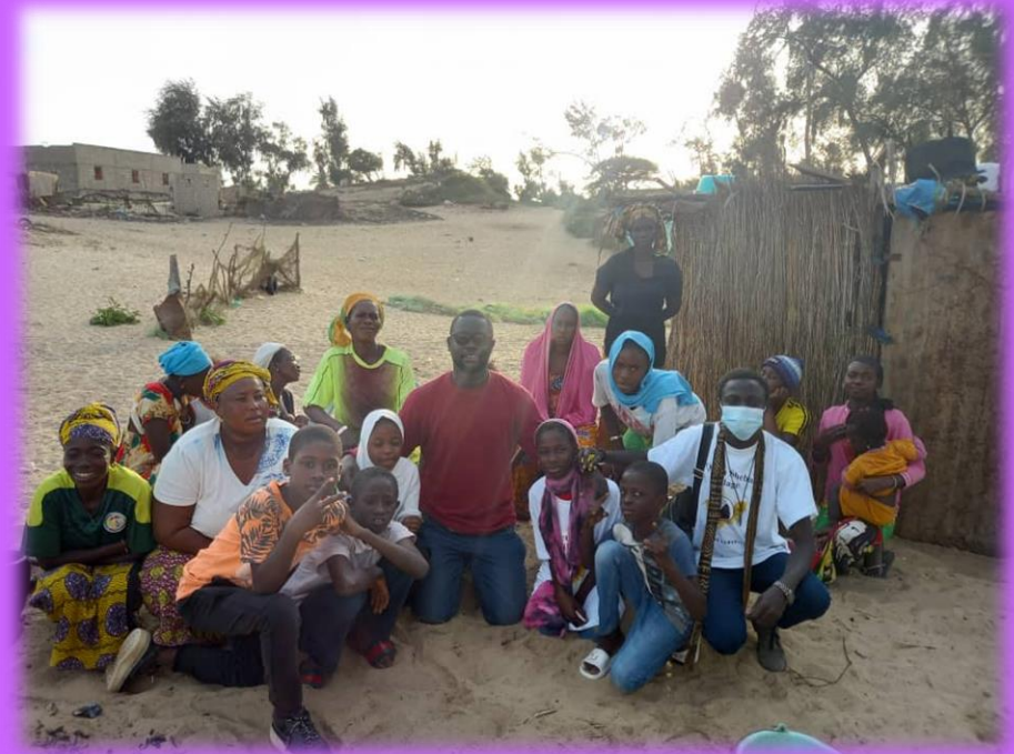
Keur Djiby Village, Mboro, Senegal