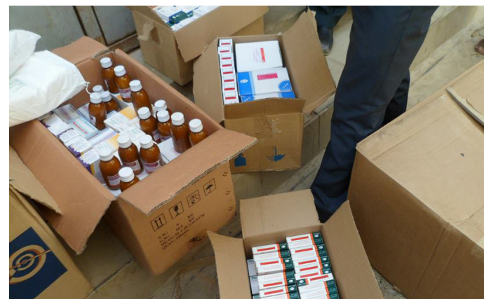
Medical distribution event day to QSV partner AAI (African American Islamic Institute)

Medical Distribution Project. Queen Sheba Village has distributed over 1,400 medical and hygiene supply kits to rural Senegalese women in collaboration with local doctors from Dakar City.