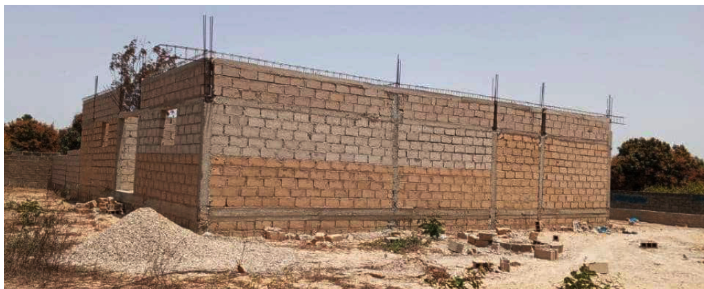
Queen Sheba Village, future home of The Women & Girls Social Center