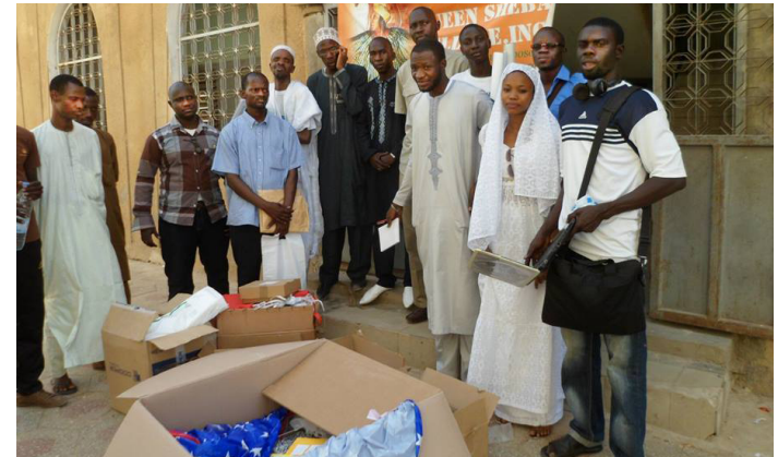
School supplies distriibution event to benefit students at African American Islamic Preschoolers

Education, Food, healthcare, toys and new clothes is our contribution to the children in need and the organizations who work in these related occupations. We are more than delighted to support these efforts.